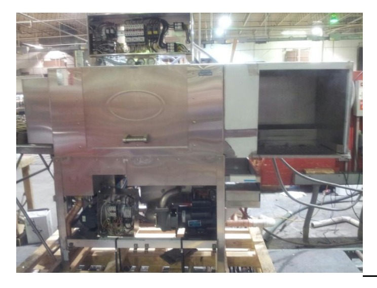
Right to Left ADC-44 with Side-Loader attached