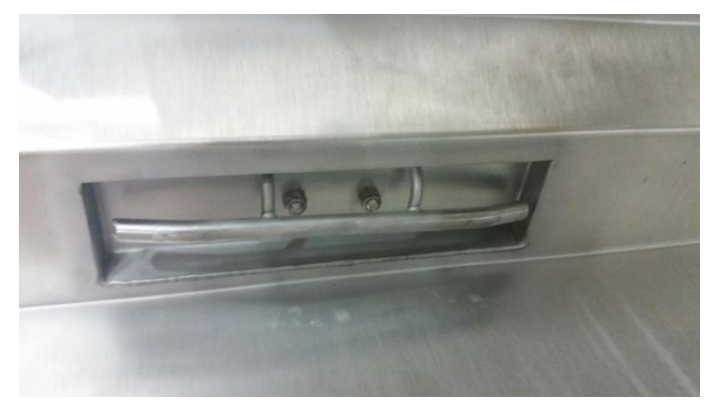
Bumper attached thru pocket to tilt plate