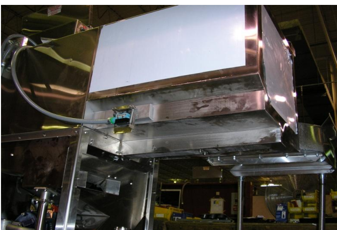
Lower pan of loader fits inside the DM tank and bolts