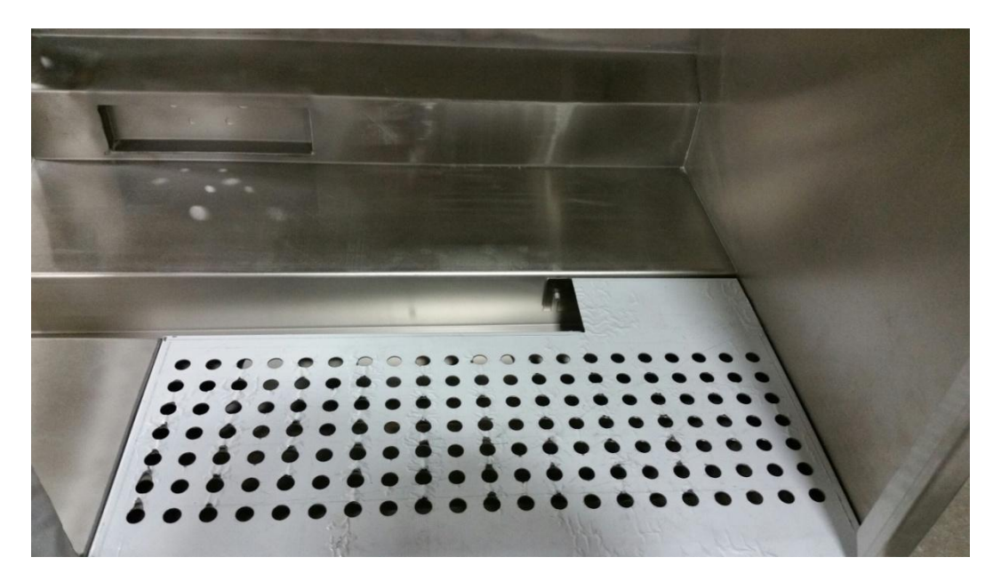
Showing the full ramp and the pocket for the start switch in upper left of picture