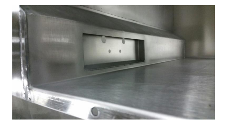
Pocket for bumper start switch