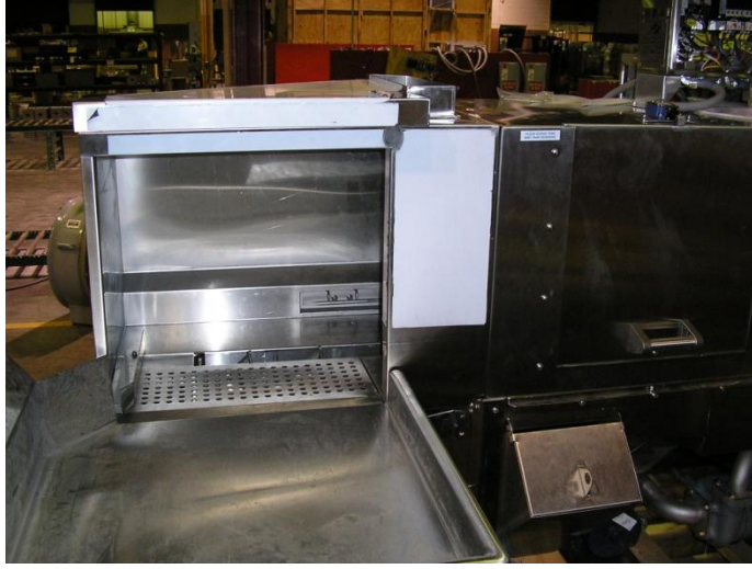
Left to Right ADC-66 with sideloader/vent attached