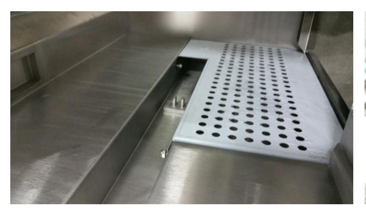
Ramp installed and held by two studs and lock nuts.