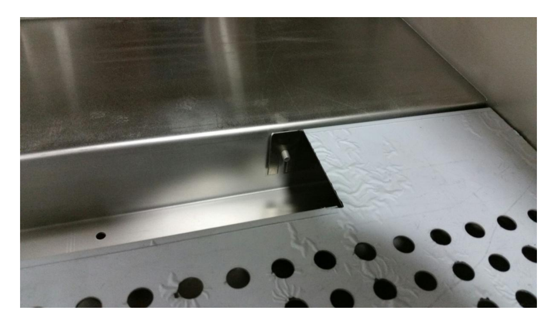
Ramp bolts in place for racks to slide over the conveyor bar.