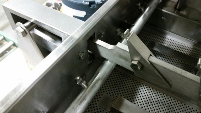
Conveyor bar attaches to rocker arm on clean side of DM