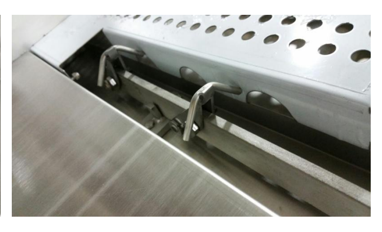
Conveyor bar with loader dogs (285-6138)