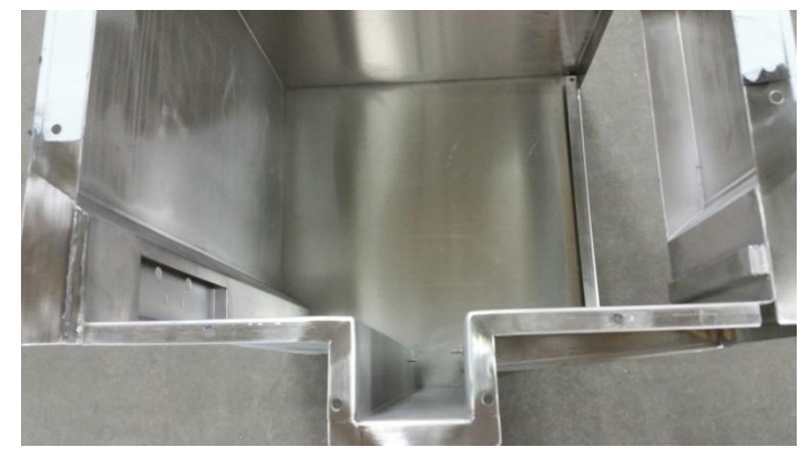
Trough for conveyor bar and rubbing block guide