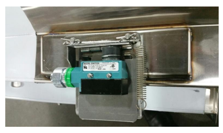
Switch bolted to shuttle and installed on tilt plate