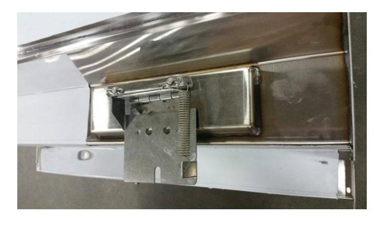
Showing tilt plate and holder for switch shuttle