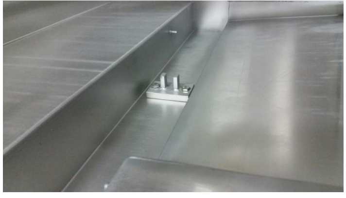
Rubbing block (285-6187) bolted in place